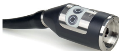
With push buttons