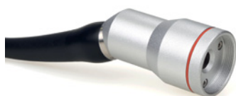
Without push buttons