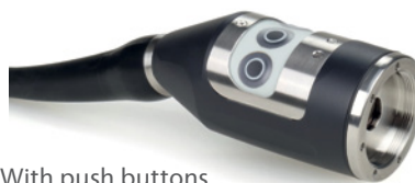
With push buttons