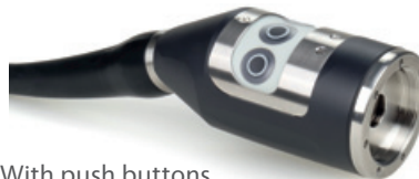
With push buttons