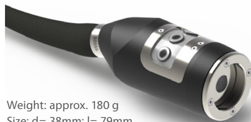
Weight: approx. 180 g Size: d= 38mm; l= 79mm (without bending sleeve)