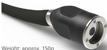
Weight: approx. 150g Size: d= 36,5mm; l= 65mm (without bending sleeve)